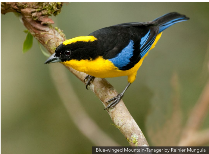
Blue-winged Mountain-Tanager by Reinier Munguia