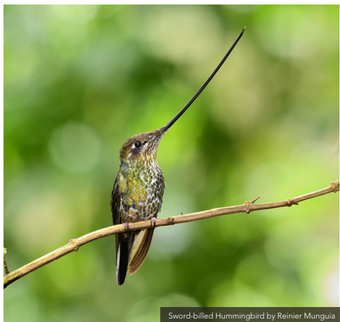
Sword-billed Hummingbird by Reinier Munguia