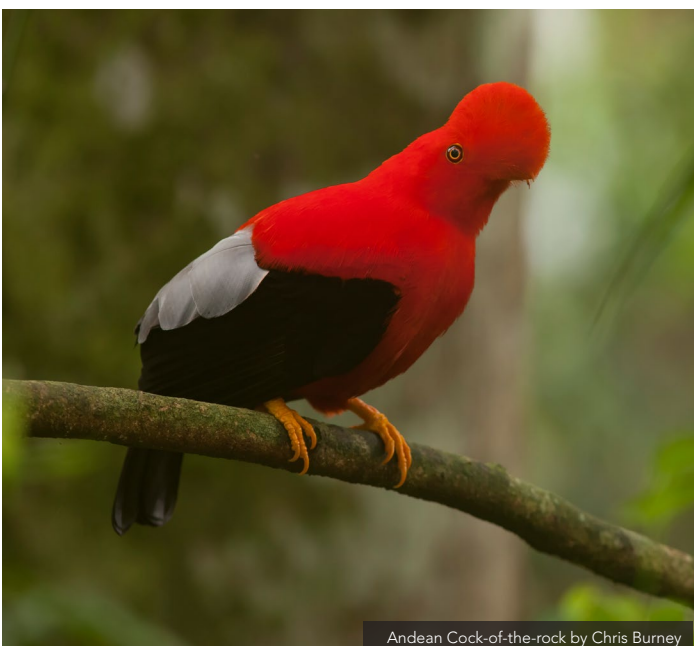
Andean Cock-of-the-rock