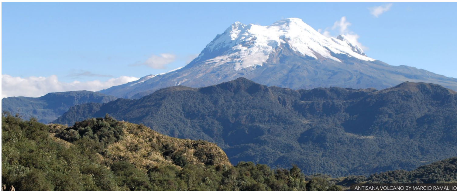
ANTISANA VOLCANO