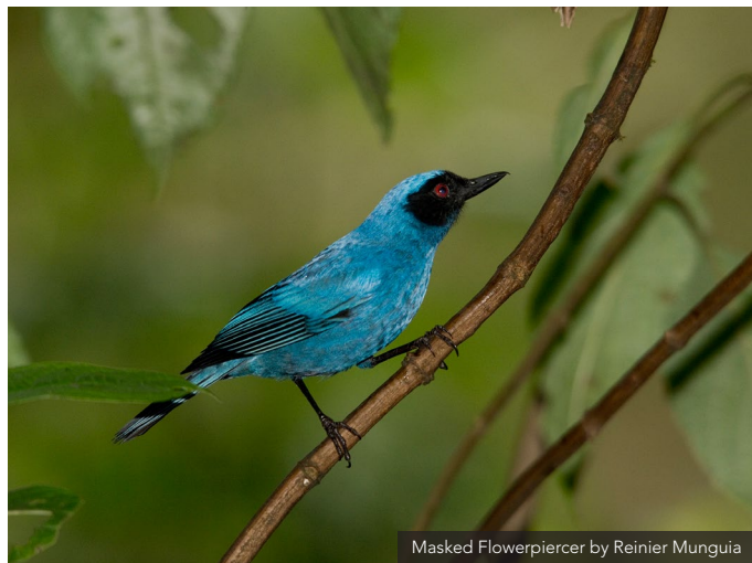
Masked Flowerpiercer