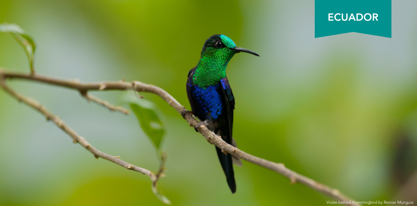
Violet-bellied Hummingbird by Reinier Munguia