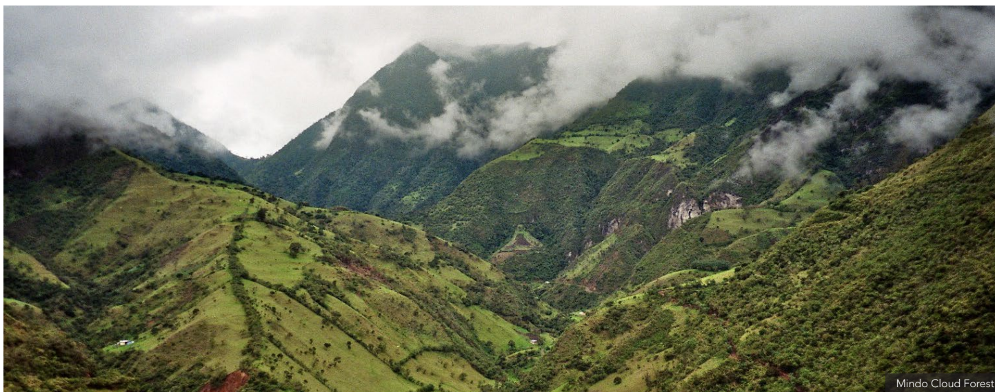
Mindo Cloud Forest